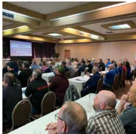
Pictured here are some harbour authority representatives participating and learning from the sessions offered at the Seminar.

preparation to make this a very successful Seminar.